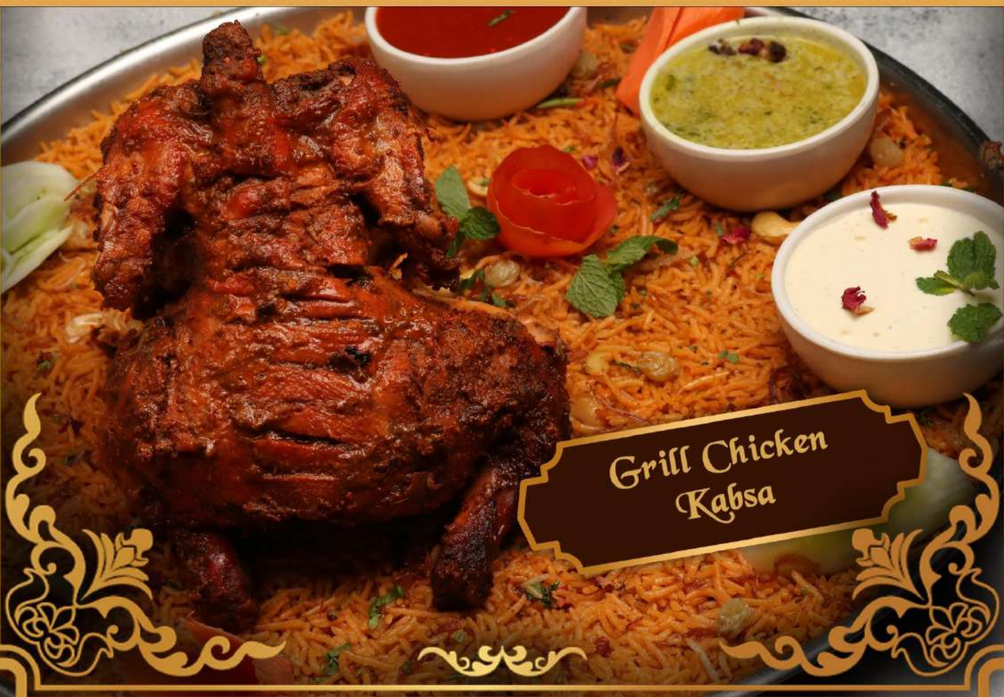
Grill Chicken Kabsa