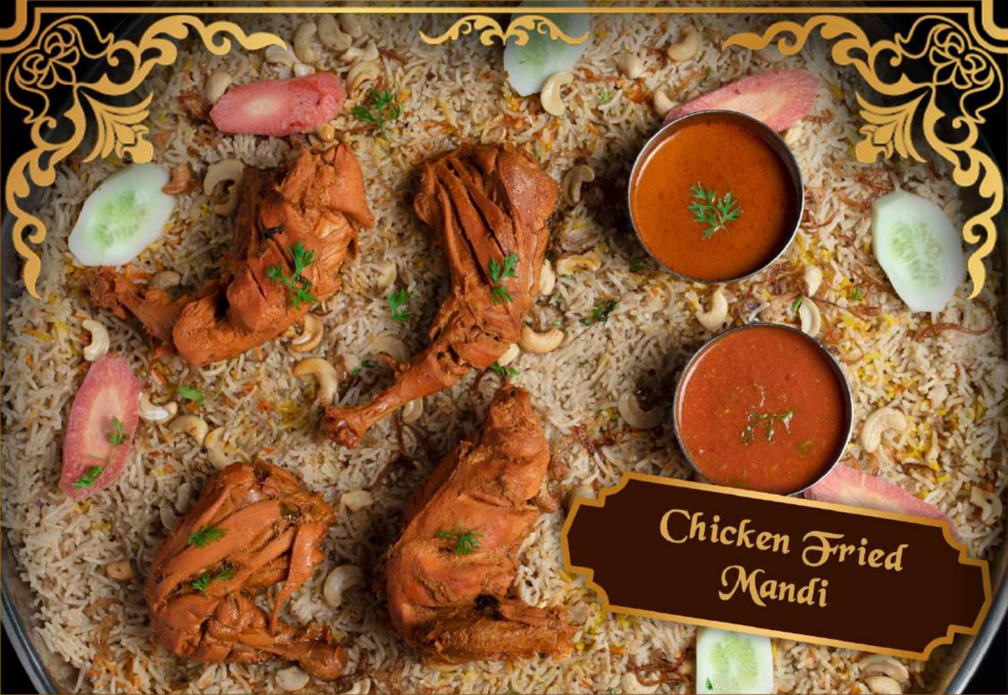
Chicken Fried Mandi