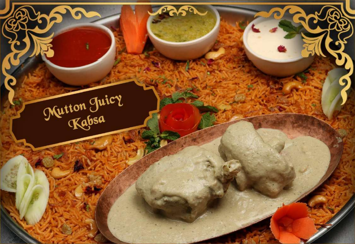
Mutton Juicy Kabsa