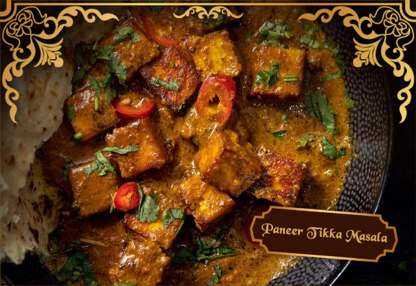
Paneer Tikka Masala