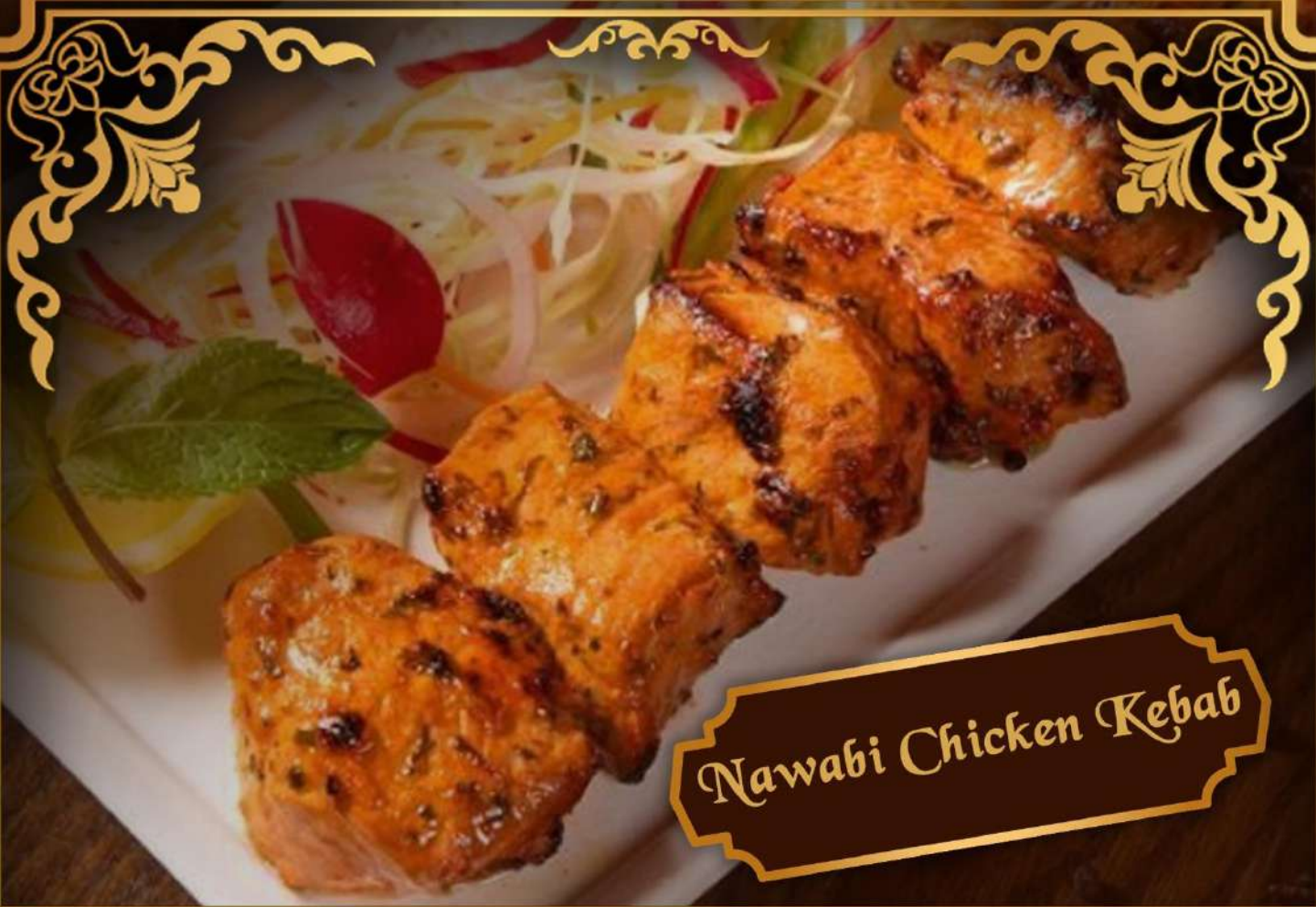
Nawabi Chicken Kebab