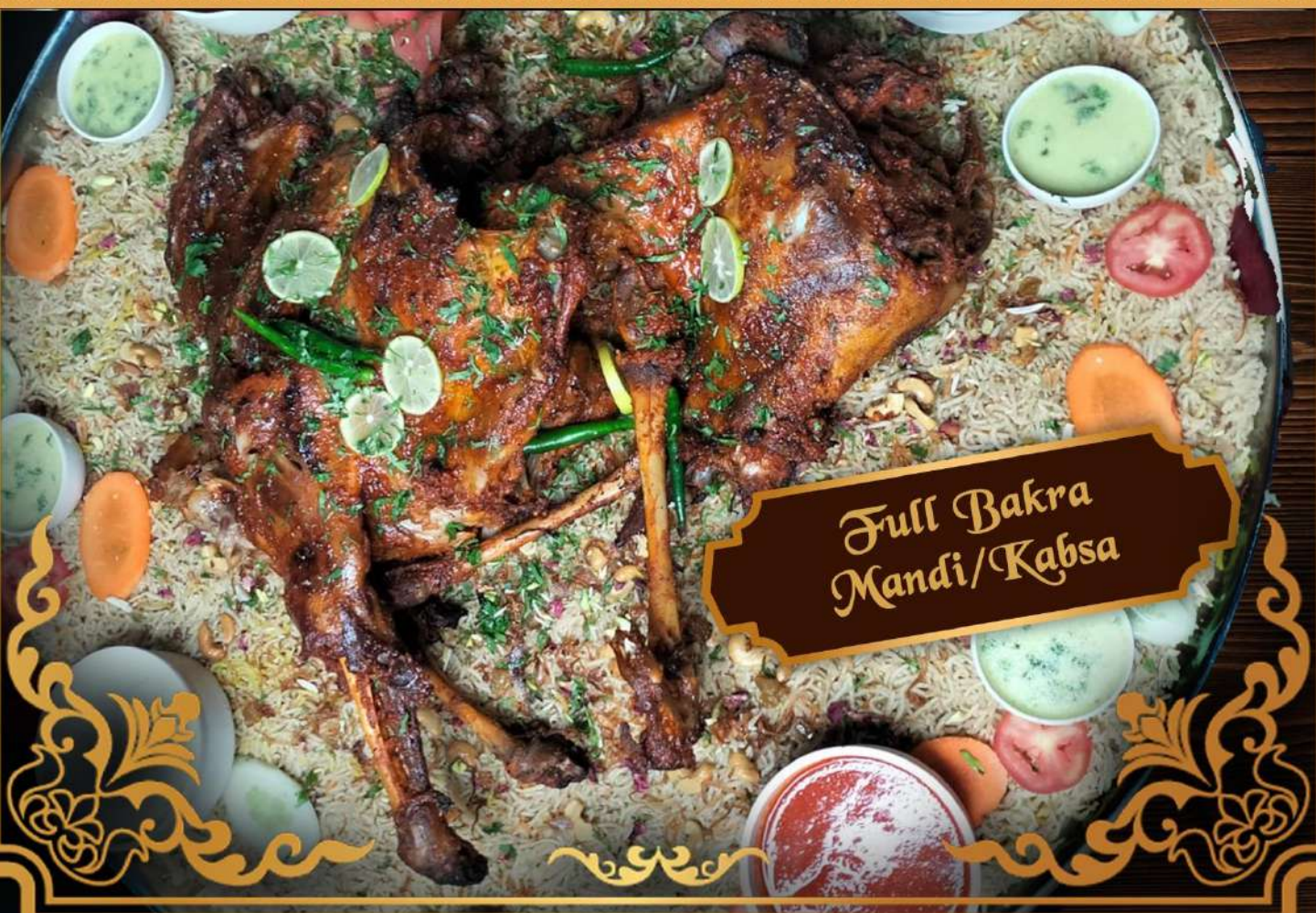
Full Bakra Mandi/Kabsa