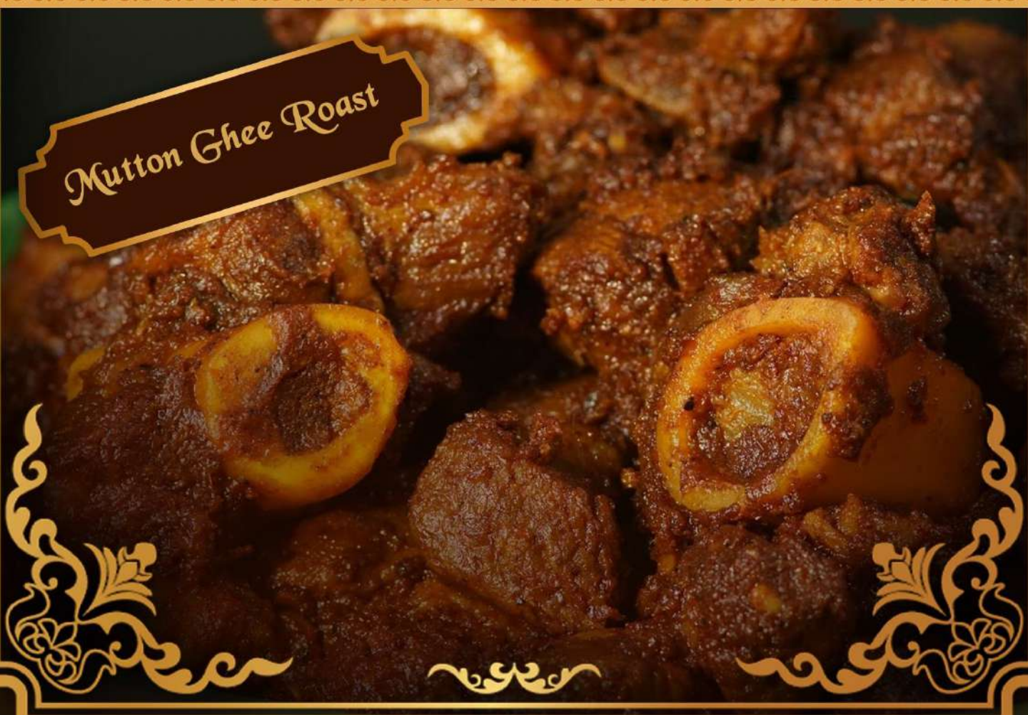
Mutton Ghee Roast