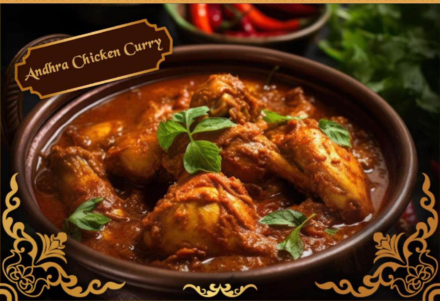
Andhra Chicken Curry