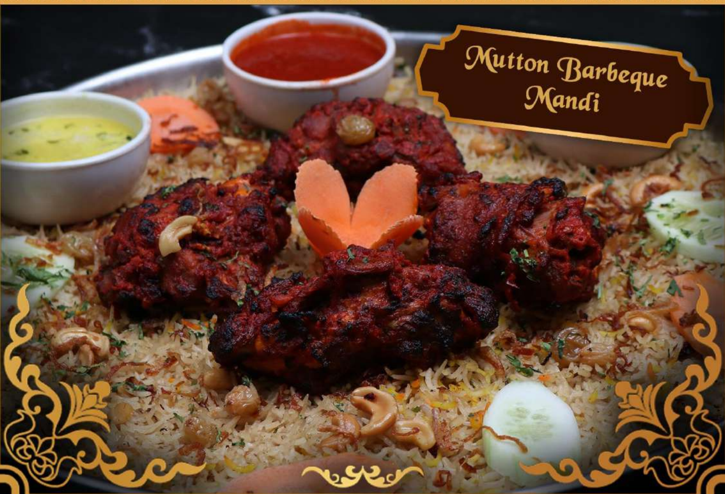
Mutton Barbeque Mandi