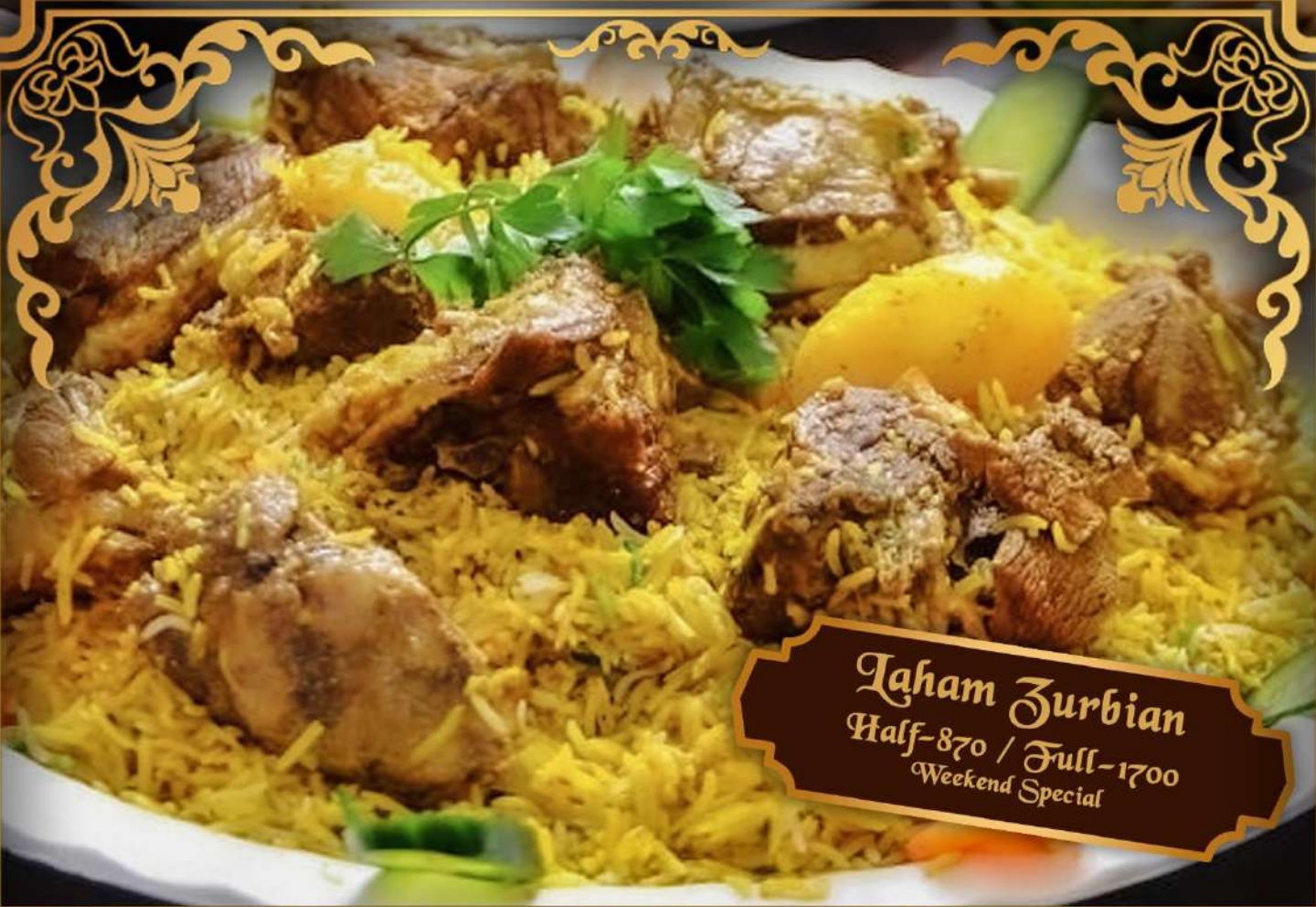
Laham Zurbian Half-870 / Full-1700 Weekend Special